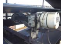
Belt Sway Switch