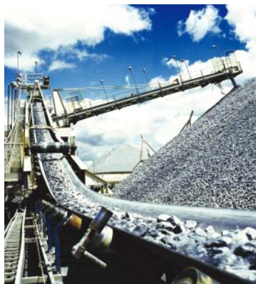
Pull Cord Switch